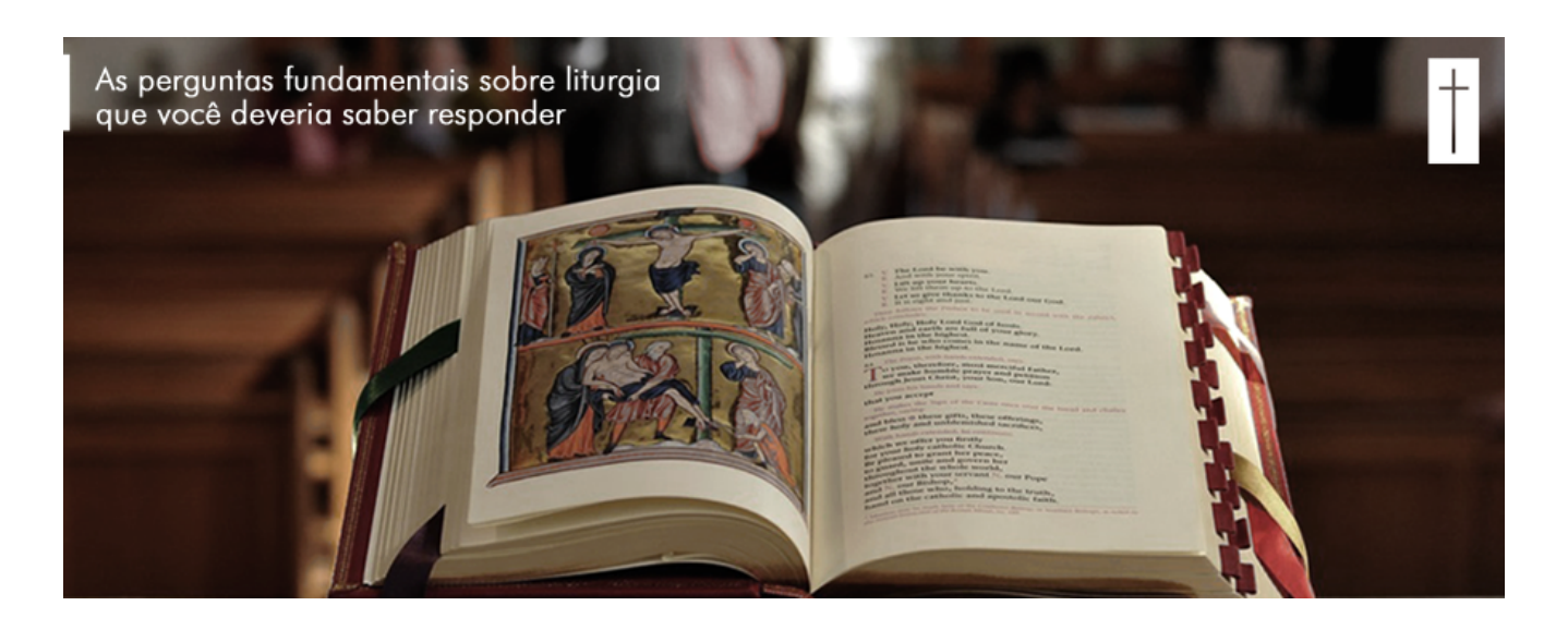
"You do not just hear about Liturgy, but live and experience the Liturgy!"

In general, the concept may be so present and latent in your everyday life that words may be lacking to actually name what it represents.